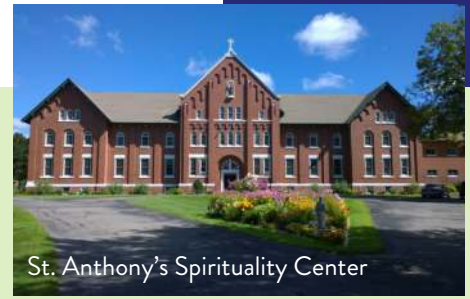
St. Anthony's Spirituality Center

Parks: Riverside Park, Veteran's Park and Tower Park are complimented by playground equipment at Marathon Elementary School and at St Mary's Catholic School.