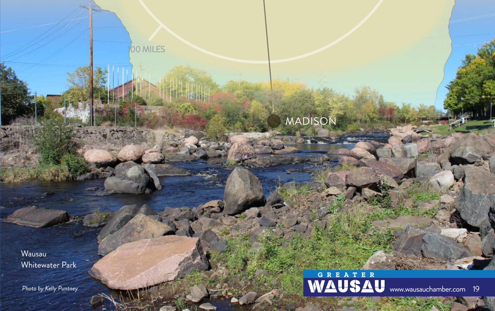
Wausau Whitewater Park