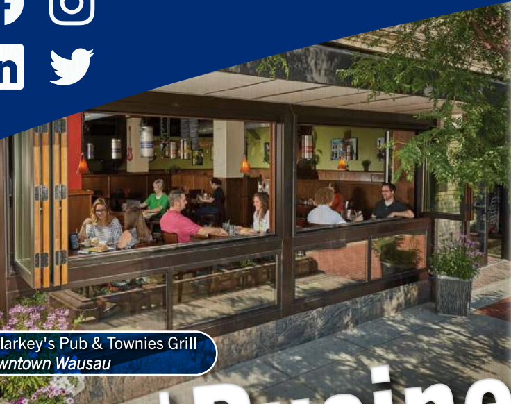
Malarkey's Pub & Townies Grill Downtown Wausau