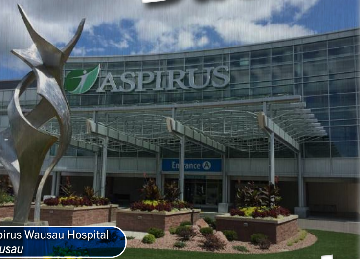
Aspirus Wausau Hospital Wausau