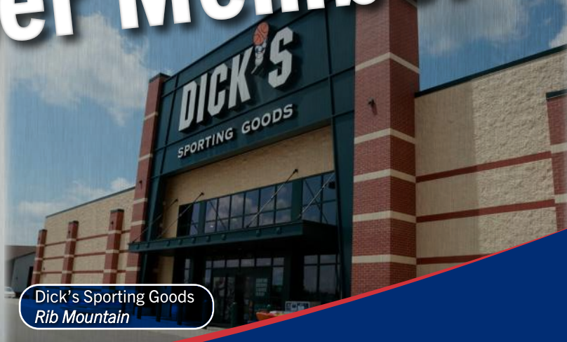
Dick's Sporting Goods Rib Mountain