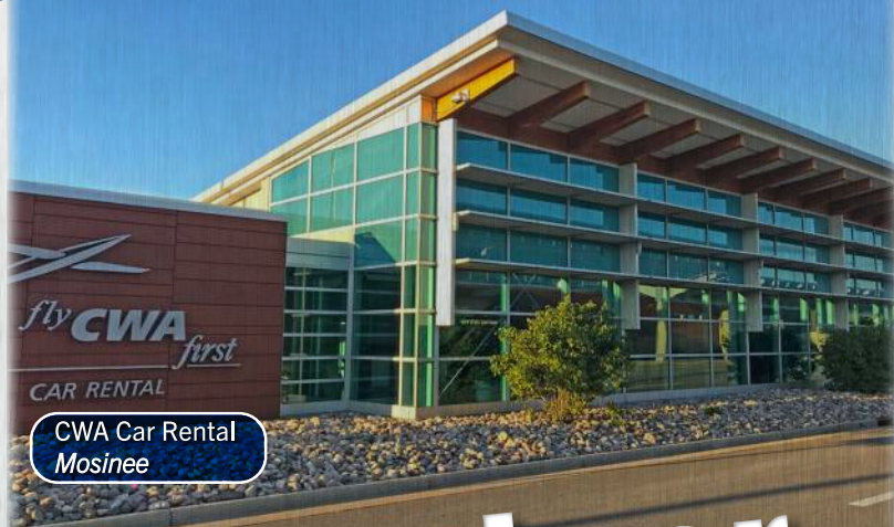
CWA Car Rental Mosinee