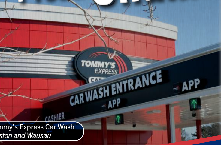
Tommy's Express Car Wash Weston and Wausau