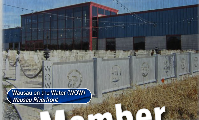
Wausau on the Water (WOW) Wausau Riverfront