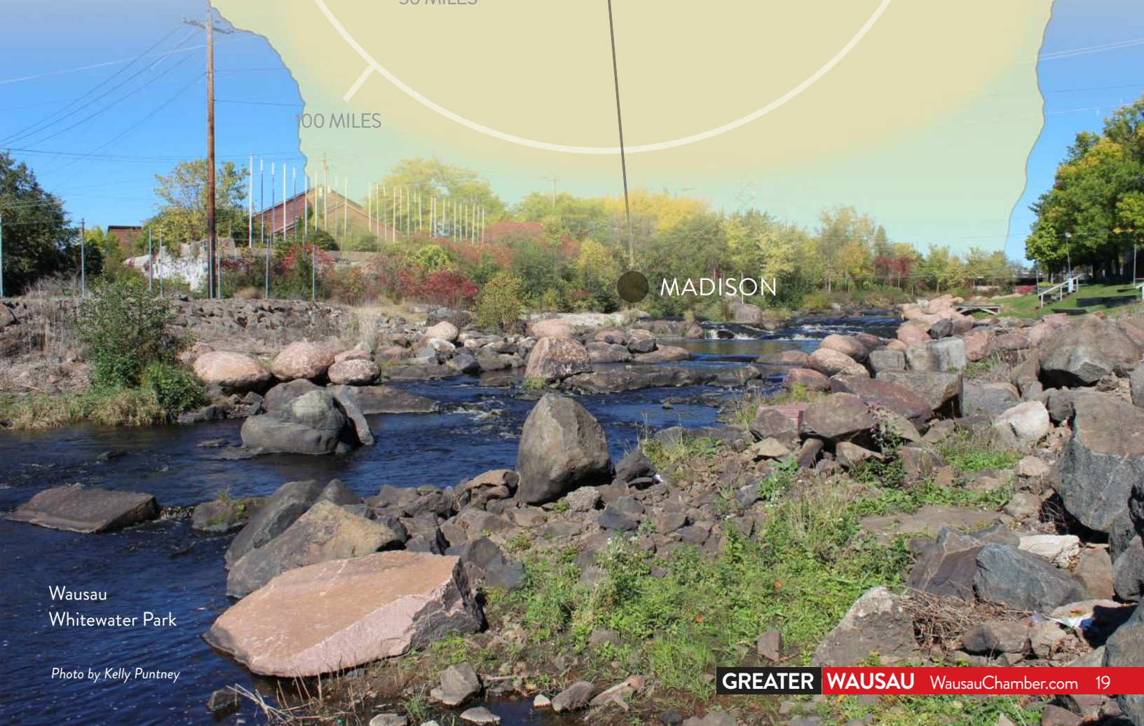
Wausau Whitewater Park