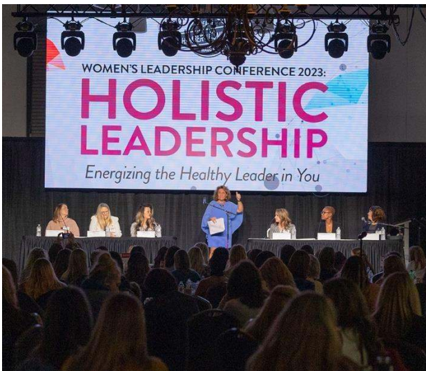
Women's Leadership Conference

Premier events are the most prestigious and high exposure events of the year and create a tremendous buzz in the business community.